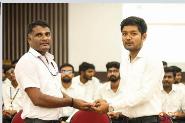
Mechanical Engineering Installation Ceremony