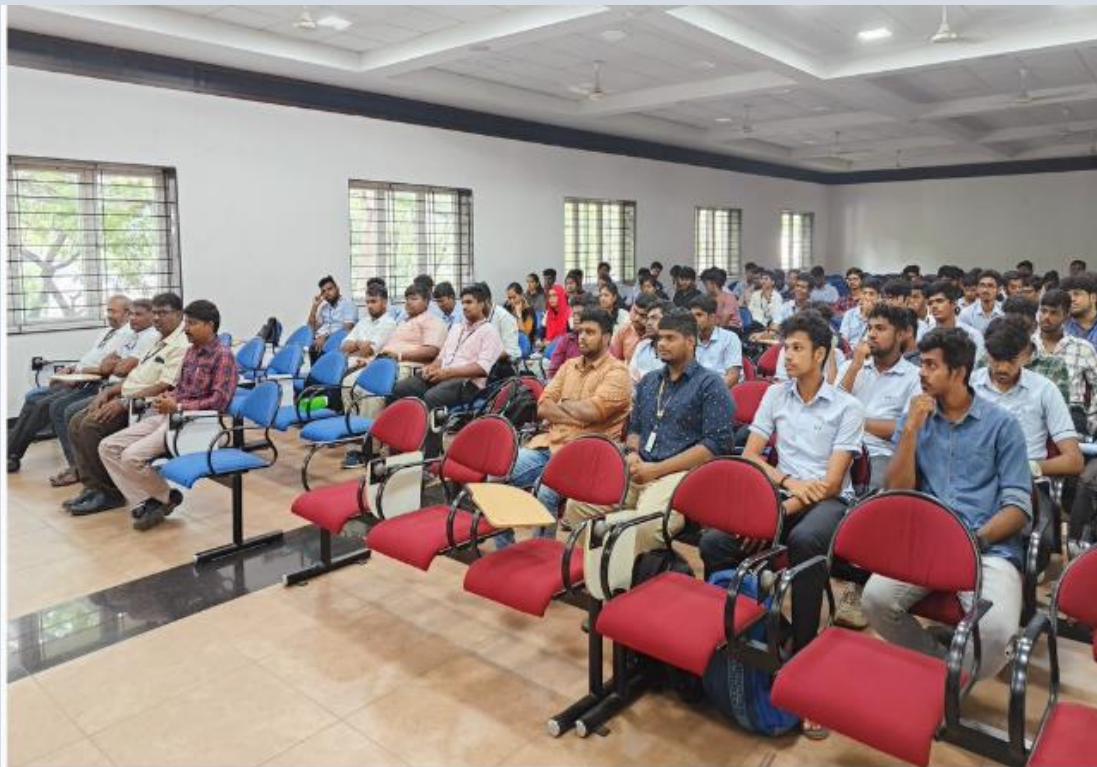
Participants during the seminar on “Unleashing Industrial Engineering”